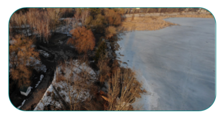
Embankment of the river junction of Tyazhliv and Southern Bug River

The project's innovative approach seeks to drive evidence-based environmental research to increase the resilience. The selected sites are representative of the city's geography, so each design solution can be expanded to maximize the replicability of the chosen approach in different areas of the Vinnytsia or in other Ukrainian cities with similar characteristics.