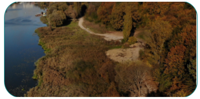
Kaspych cliffs, meadows near the cliffs along the river

The difference between scenarios lies in the varying degree of involvement, the use of the territory, and infrastructure development. The decision shall be made by the stakeholders.