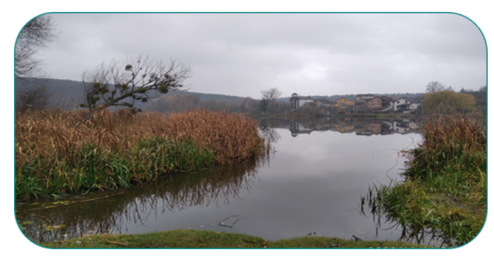
The Alley 12.7 Project area in Vinnytsia

The Alley 12.7 Project seeks to create a holistic harmonious environment along the left bank of the Pivdennyi Buh River, also known as the Southern Bug River, within the city of Vinnytsia. Through an interdisciplinary and participatory approach, the project aims to find options for proactive response and adaptation to climate change that integrate the community's vision of sustainable development and protect the biodiversity within the area of intervention.