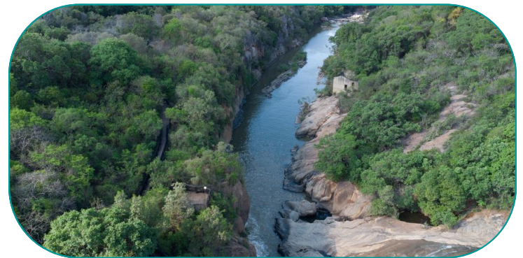
White River Mbombela, South Africa

The City of Mbombela (CoM) faces hydro-meteorological hazards due to poorly functioning river corridors, leading to compromised water security, infrastructure damage, and frequent flooding. The Transformative River and Stormwater Management Programme (TRSMP) aims to address these challenges through integrated initiatives, a dedicated implementation framework, and strategic linkages with government donors. The project's goal is to enhance the city's resilience through sustainable approaches.