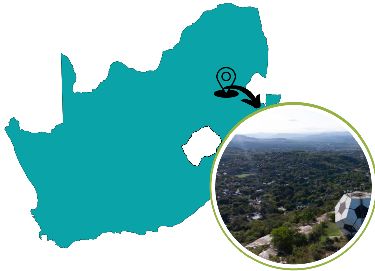
Location and Aerial view of Mbombela, South Africa (Image Source: City of Mbombela)